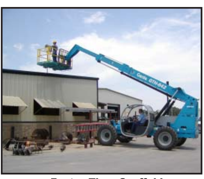
Faster Than Scaffold