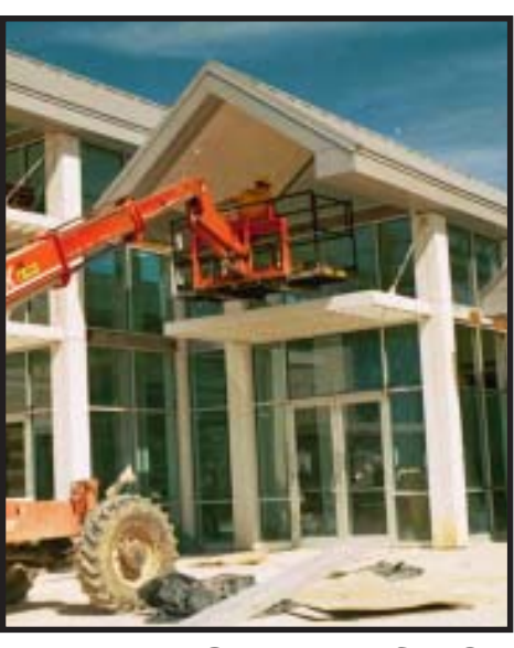
Quick-Tach & Slip-on-Forks Models Available