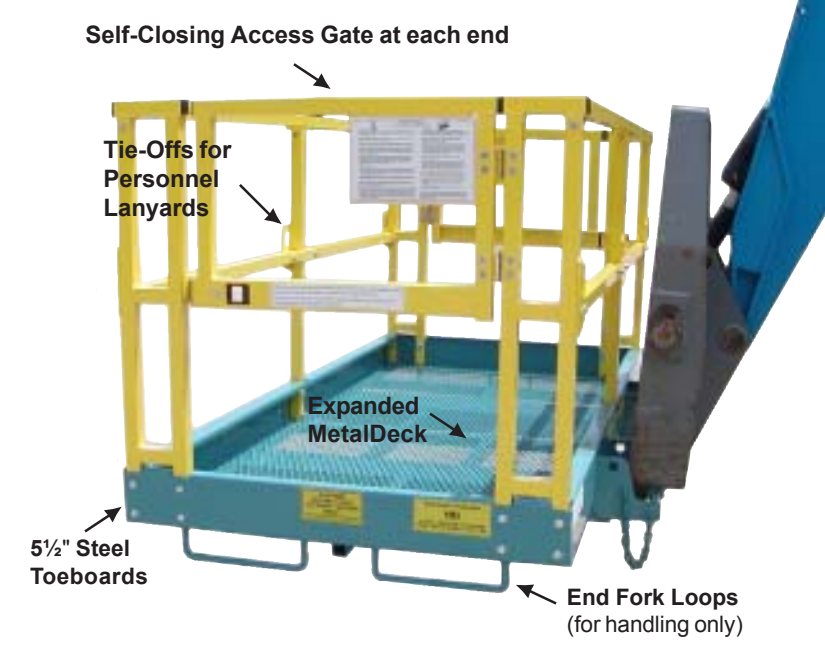
Forklift must be equipped with a "quick-tach".